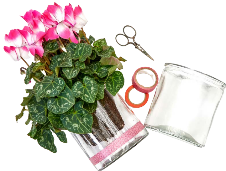
Table decorations with cut cyclamen

Simply wrap empty jars or other glass containers with decorative tape or ribbons that match the colour of these bright blooms. To keep decorations in place, it's important to clean glass jars thoroughly beforehand. Tip: Since there are no drainage holes in jars, water very carefully. Indiaka cyclamen like to be kept slightly moist, but they don't tolerate waterlogging!